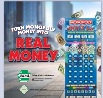
Violator; 8"x 8"