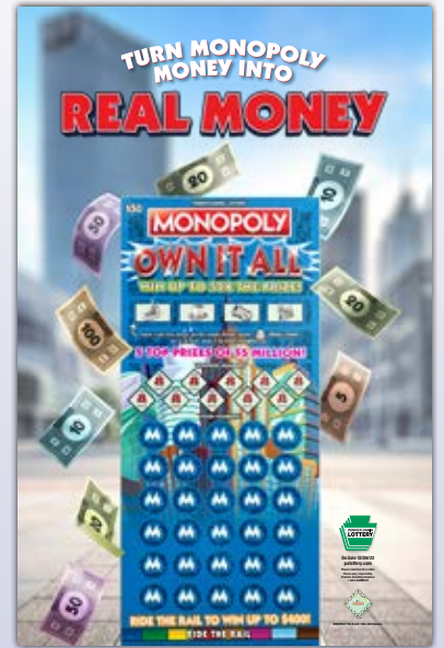
Poster; 11"x 17" Double-Sided