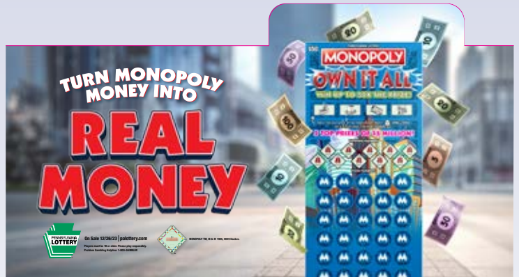
PDH Topper, Die-cut; 35"x 19"