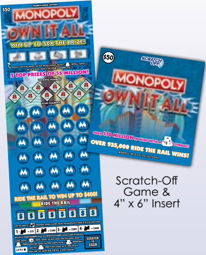
Scratch-Off Game & 4" x 6" Insert