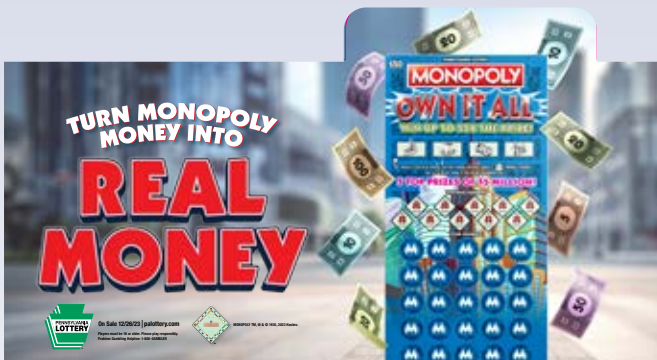
ITVM Topper, Die-cut; 29"x 17"