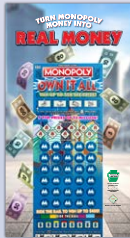
Bollard Topper 8.5"x 15.5"