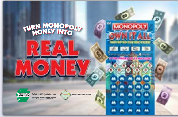
Poster; 17"x 11" Horizontal