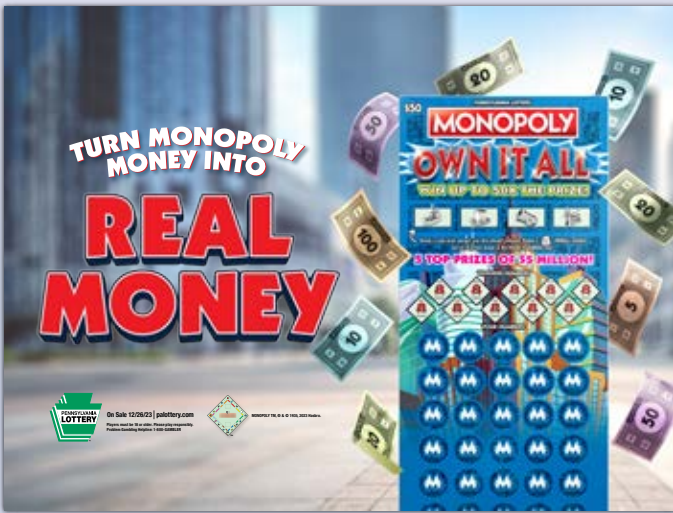
BackLit Insert Sign; 24"x 18"