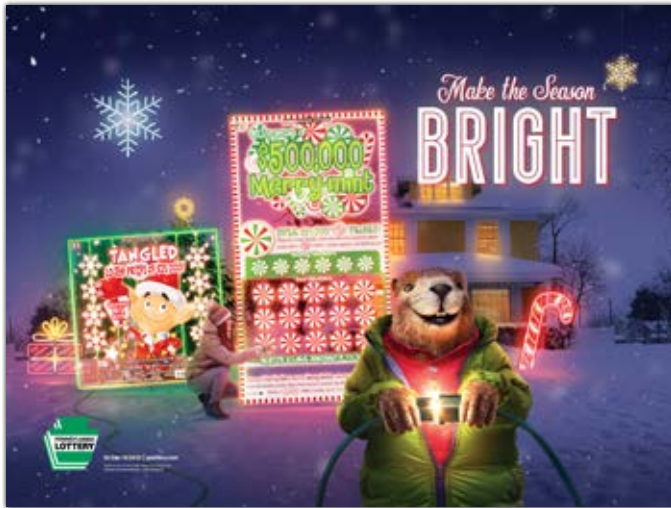
BackLit Insert Sign; 24"x 18"