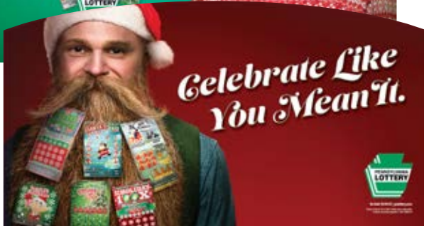
ITVM Topper, Die-cut; 29"x 17", Double-Sided