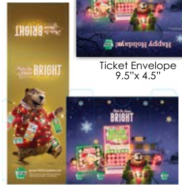
Ticket Envelope Holder, Die-cut