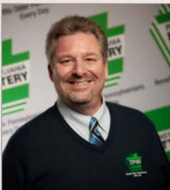
Best in Selling,