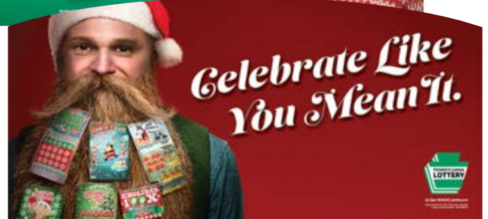
PCT Topper, Die-cut; 35"x 19", Double-Sided