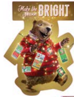
Gus 16"x 16" Die-cut