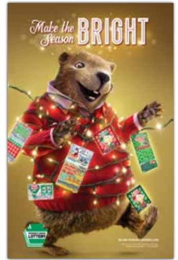
Posters; 11"x 17" Double-Sided, Single Sided