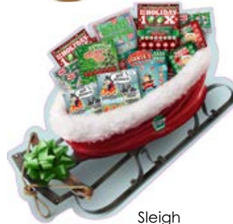
Sleigh 16"x 16" Die-cut