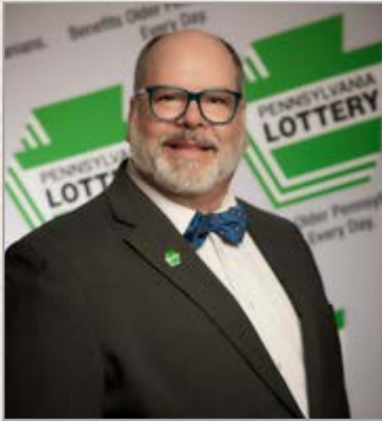
Best in Selling,