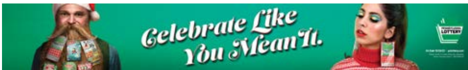
Walmart PHDL Topper; 35"x 5"