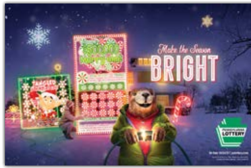
Poster; 17"x 11" Horizontal