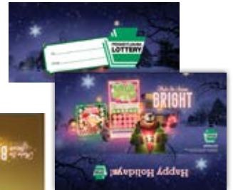
Ticket Envelope 9.5"x 4.5"