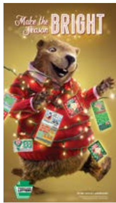
Bollard Topper 8.5"x 15.5"